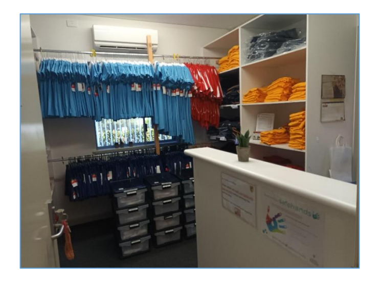
'Our well stocked' Uniform Shop