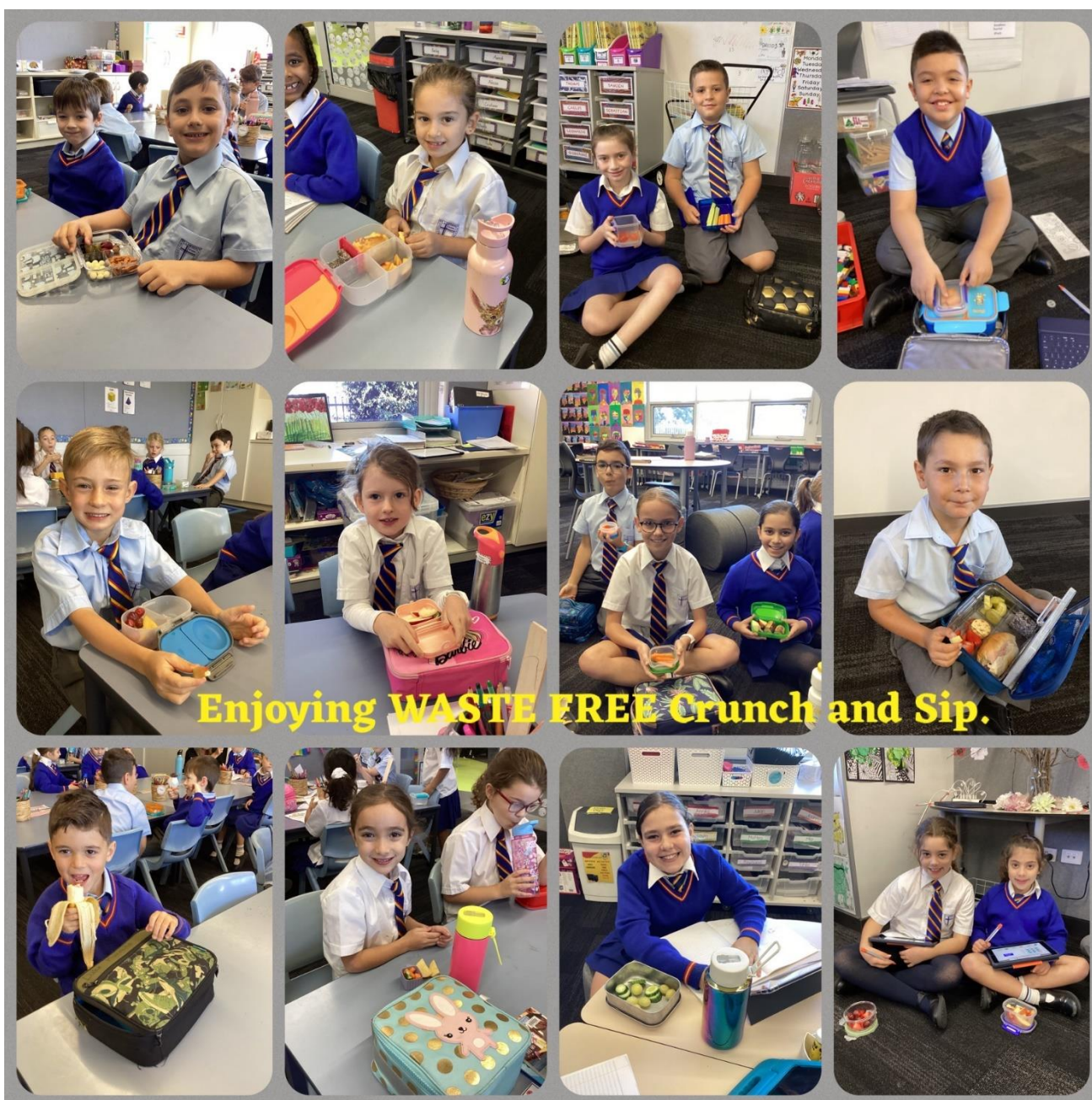
Enjoying WASTE FREE Crunch and Sip.