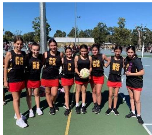
Year 6/7 (U13) Team

We wish our Year 1/2 (U8), Year 3 (U9) & Year 4/5 (U10) teams all the best for their first game of the season this Friday. Good luck!