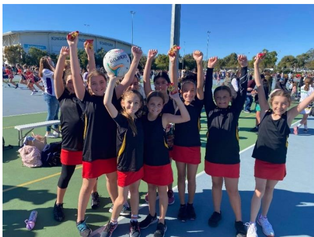
Year 5 (U11) Team

Congratulations to our Year 5 (U11) & Year 6/7 (U13) teams on their first win for the season.