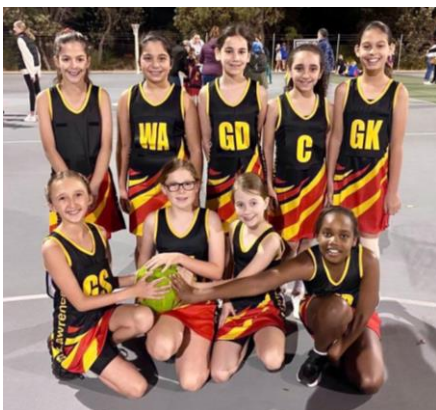
Year 5/6 (U11) Team

Best of luck to all our teams going into Round 2.