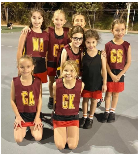
Year 2/3 (U8) Team

The Winter Netball Season commenced last week. Congratulations to our Year 2/3 (U8), Year 4 (U9) & Year 5/6 (U11) teams on their first win for the season.