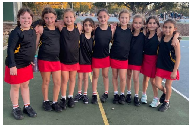
Year 4 (U9) Team