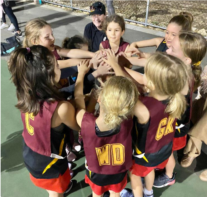
Year 2/3 (Under 8) Team