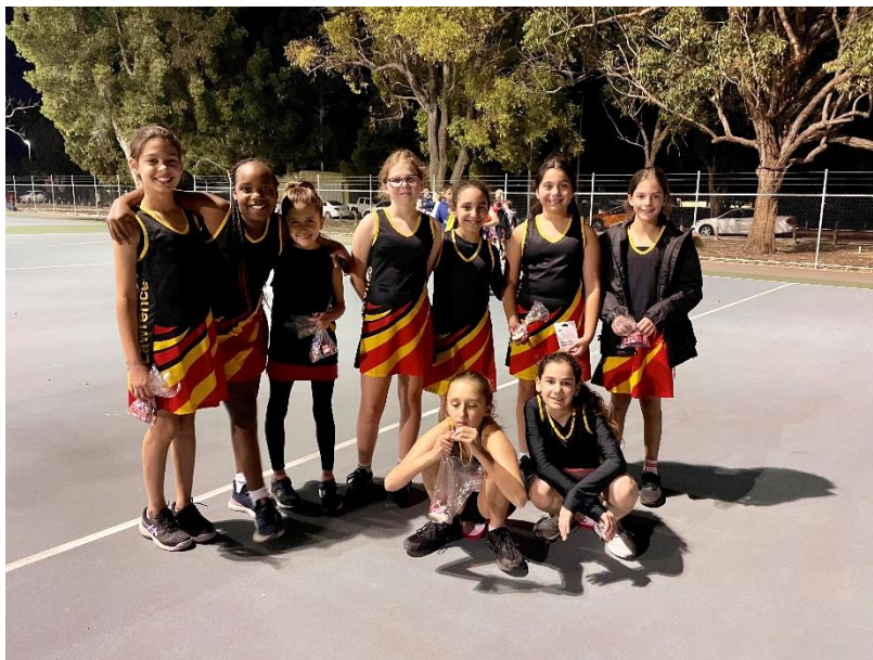
Year 5/6 (under 11) Team

Just a reminder that this week is a general bye (long weekend) so there will be no games on Friday 3rd & Saturday 4th June. Grading will be done during this time and we will advise teams of any changes. Round 6 will recommence as of Friday 10th & Saturday 11th June.