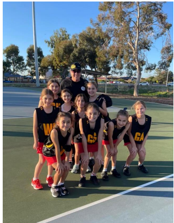
Year 4 (Under 9) Team