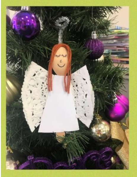
made Christmas Angels.