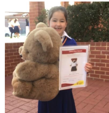
Lawry Bear Award Winner