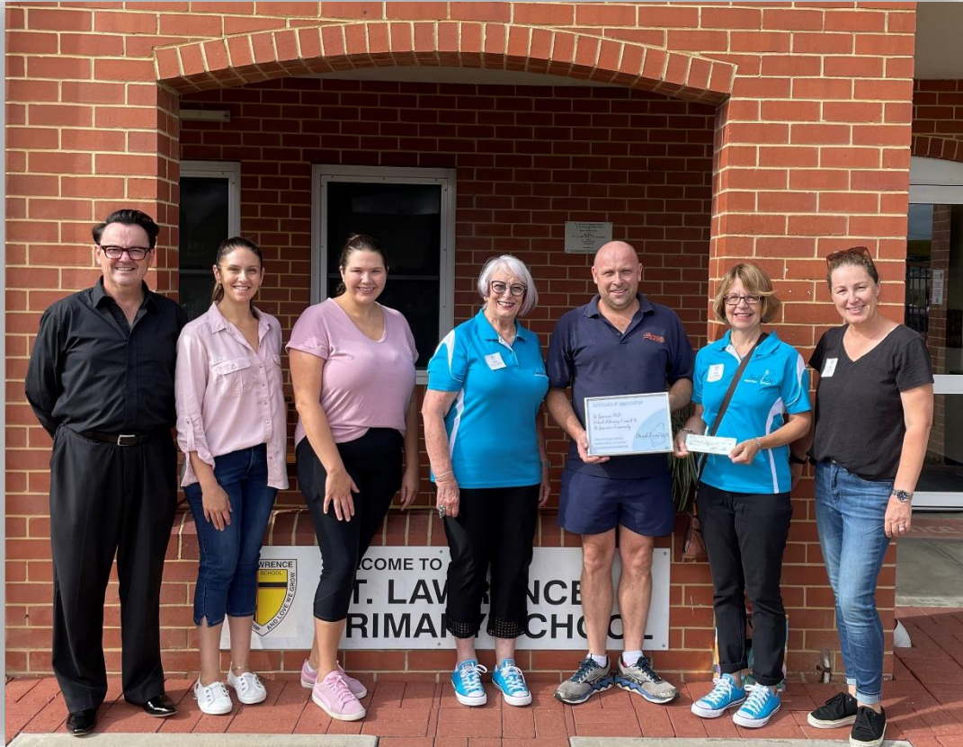
Dandelions WA representatives presenting “Certificate of Appreciation” to the School Principal and P&F Executive

A total of $4,600 was raised. We would like to extend our heartfelt thanks to the families who donated as well as the School Advisory Council for their contributions. The funds that would have ordinarily been spent at the welcome picnic will be well received by those who have lost everything in supporting them to rebuild their lives.