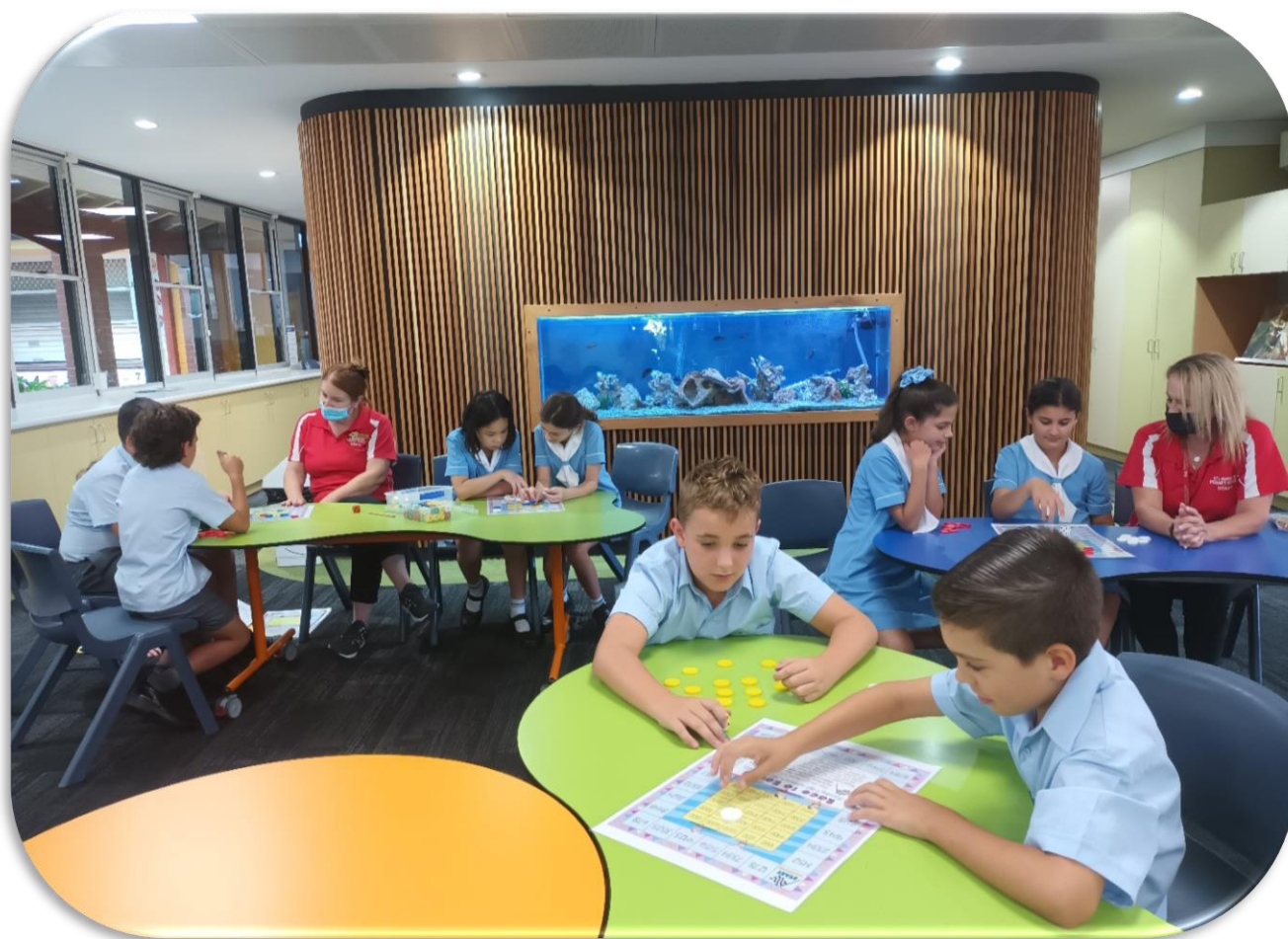
Year Five “Maths Games”