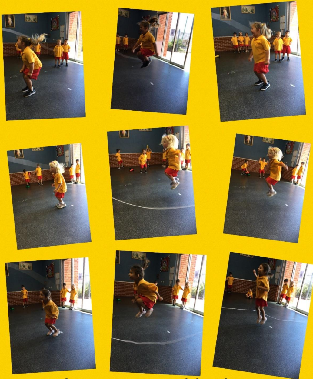
Large rope skipping