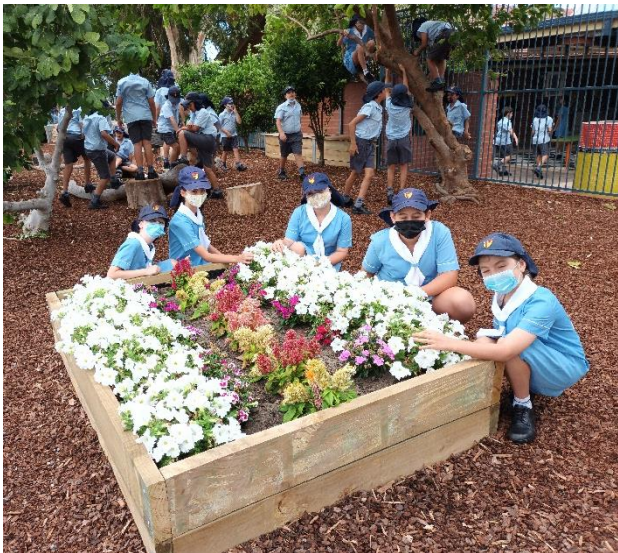
'Orchard time' with our Year Fives!