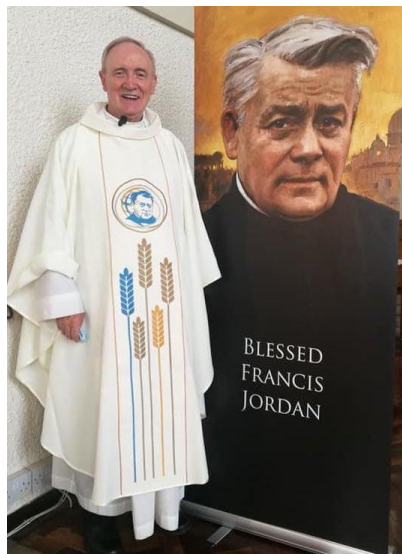
Blessed Francis Jordan Pray for us