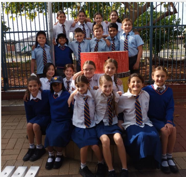
Our 'MJR' moment!