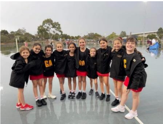
Year 4 (U9) Team