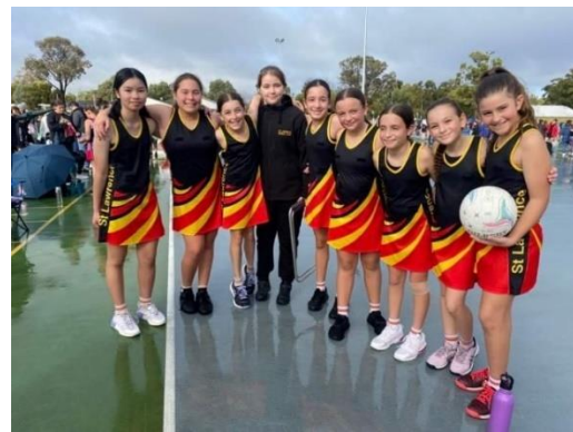
Year 6 (U12) Team