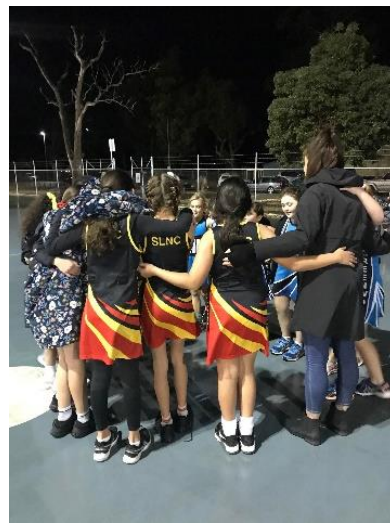
Year 5/6 (U11) Team