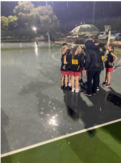
Year 2/3 (U8) Team