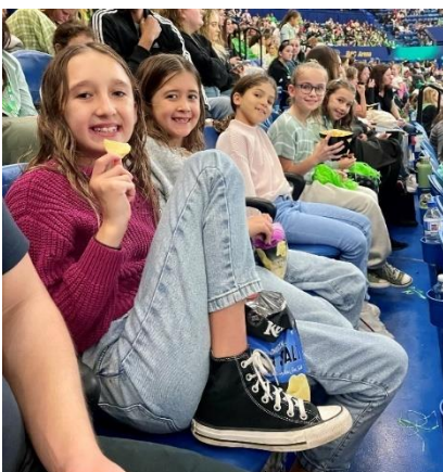
West Coast Fever vs Adelaide Thunderbirds game