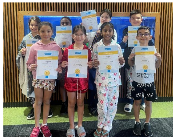
Mathletics Awards – 19.5.2023