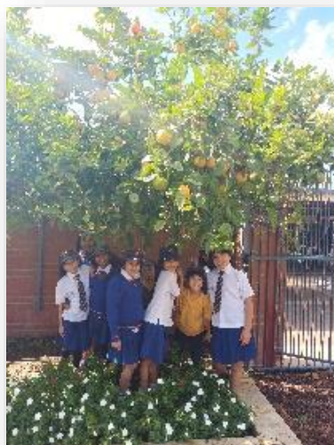
"Our Lemon Tree"