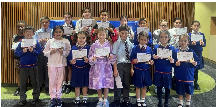
Merit Award Winners – 19.5.2023