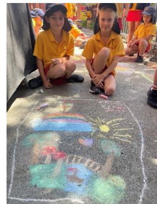
Outdoor Classroom Day 'Fun'